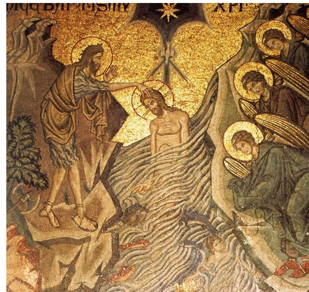
Detail of a mosaic in the Cathedral of San Marco, 13th c., Venice.

We believe children learn to worship by being in worship, so childcare for children (infant to kindergarten) begins after the Time for Children. The adult attendants will lead children out of the sanctuary to their room in the basement of the Education wing.