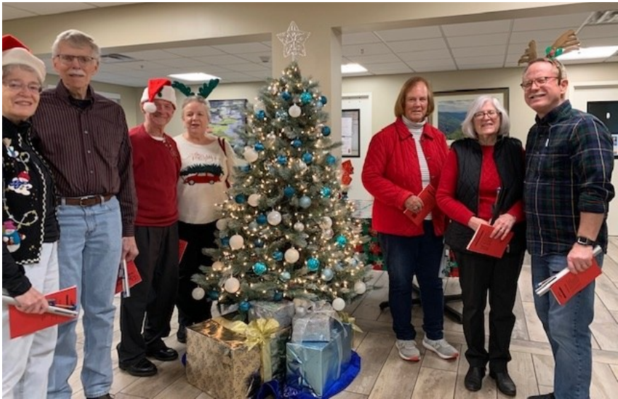
Caroling at Charleston Healthcare - bringing the joy of the season!